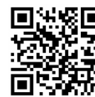
Check us out on the web: www.fbcsavmo.com

Check out our VENMO account. This platform can ONLY be used to make purchases and/or pay- ments for events at FBC! Tithes and Offerings cannot be made through VENMO.