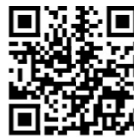
Like us on Facebook: First Baptist Church Savannah, MO